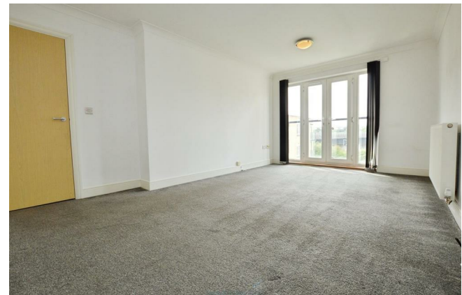
Griffin Court, Black Eagle Drive, Northfleet