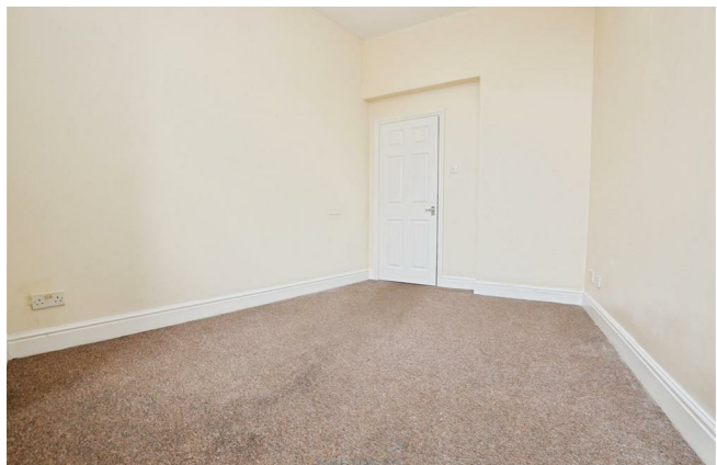
Admiral Court, Crown Street