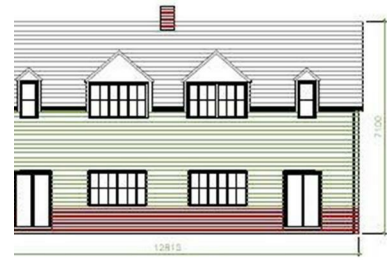
INDICATIVE REAR ELEVATION TO 2 BED 2 STOREY DWELLINGS 1:100