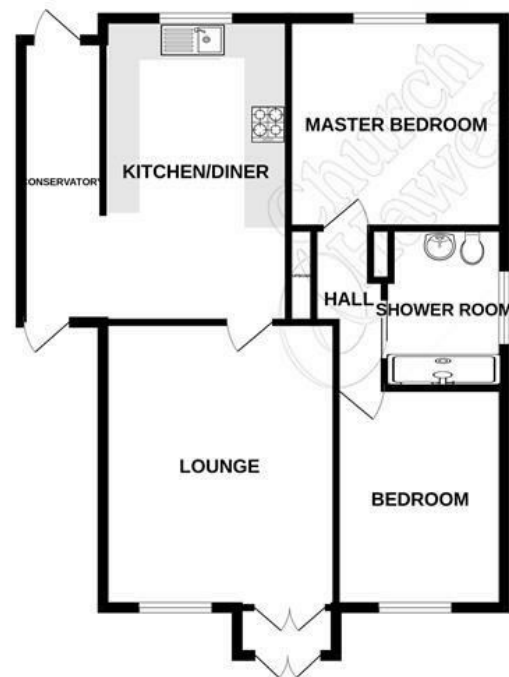
2 BED BUNGALOW

Whilst every attempt has been made to ensure the accuracy of the floorplan contained here, measurements of doors, windows, rooms and any other items are approximate and no responsibility is taken for any error, omission or mis-statement. This plan is for illustrative purposes only and should be used as such by any prospective purchaser. The services, systems and appliances shown have not been tested and no guarantee as to their operability or efficiency can be given. Made with Metropix ©2025