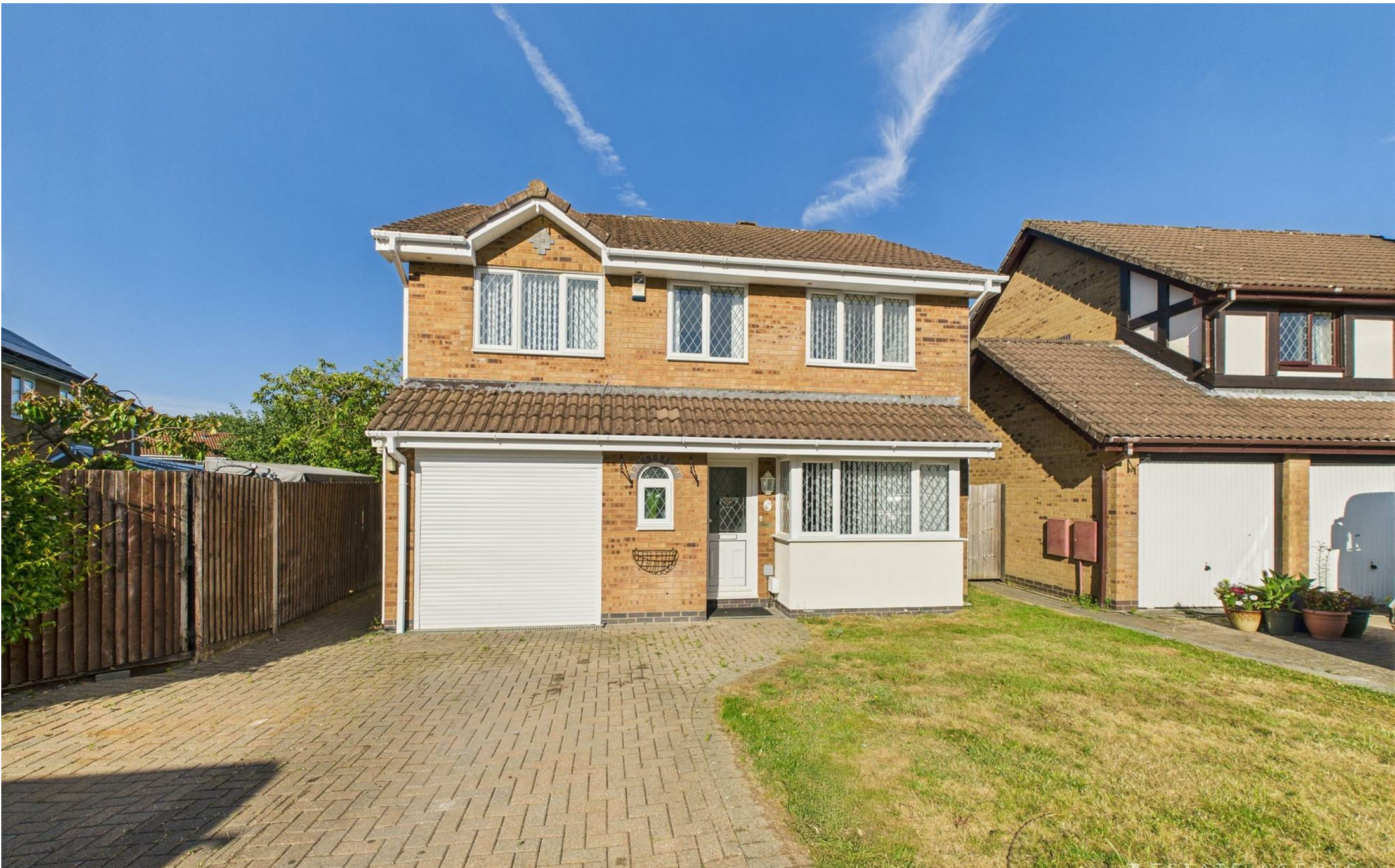
The Cornfields, Hatch Warren, Basingstoke, RG22 4QB