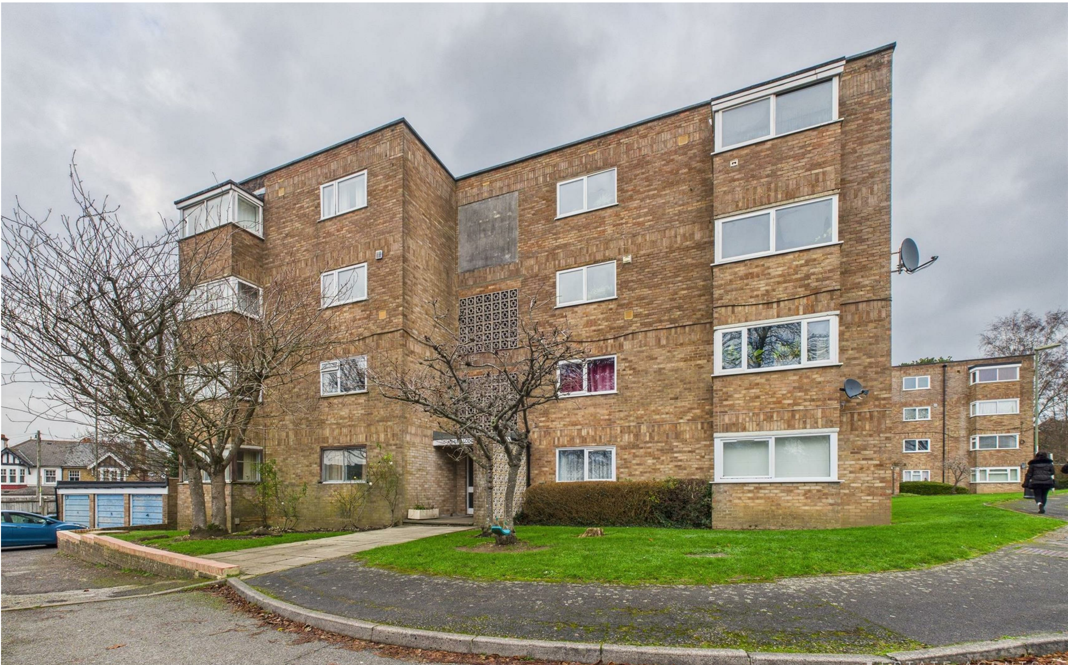
Ashley Lodge, Basingstoke, RG21 3NE £180,000 Guide price - Leasehold