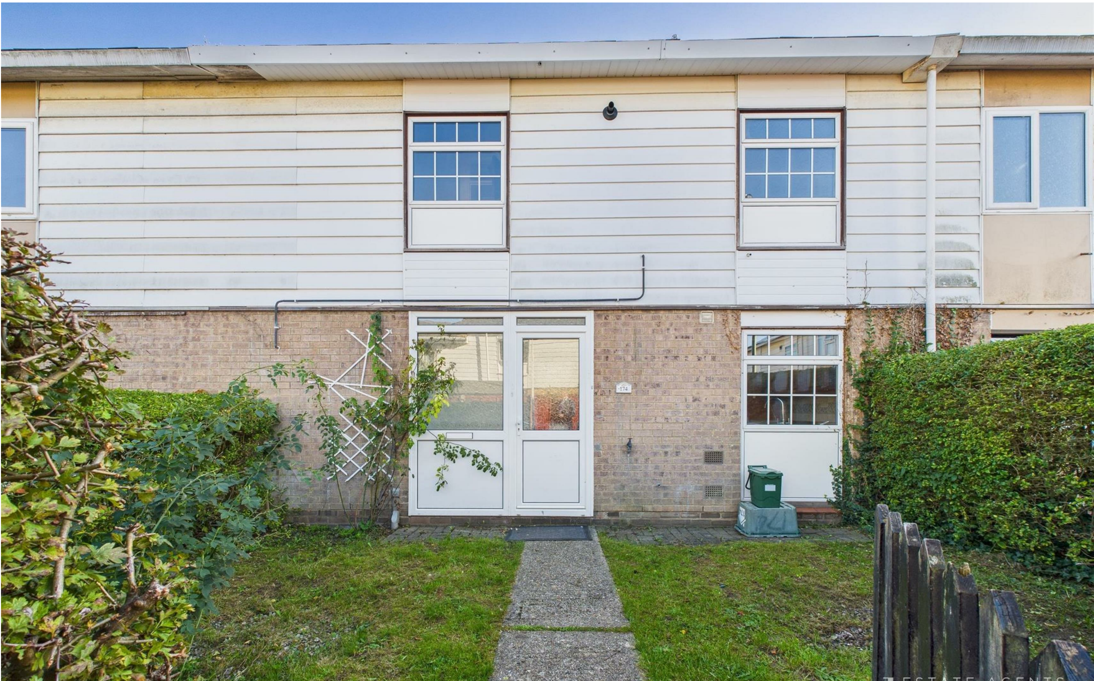
Abbey Road, Basingstoke, RG24 9EF