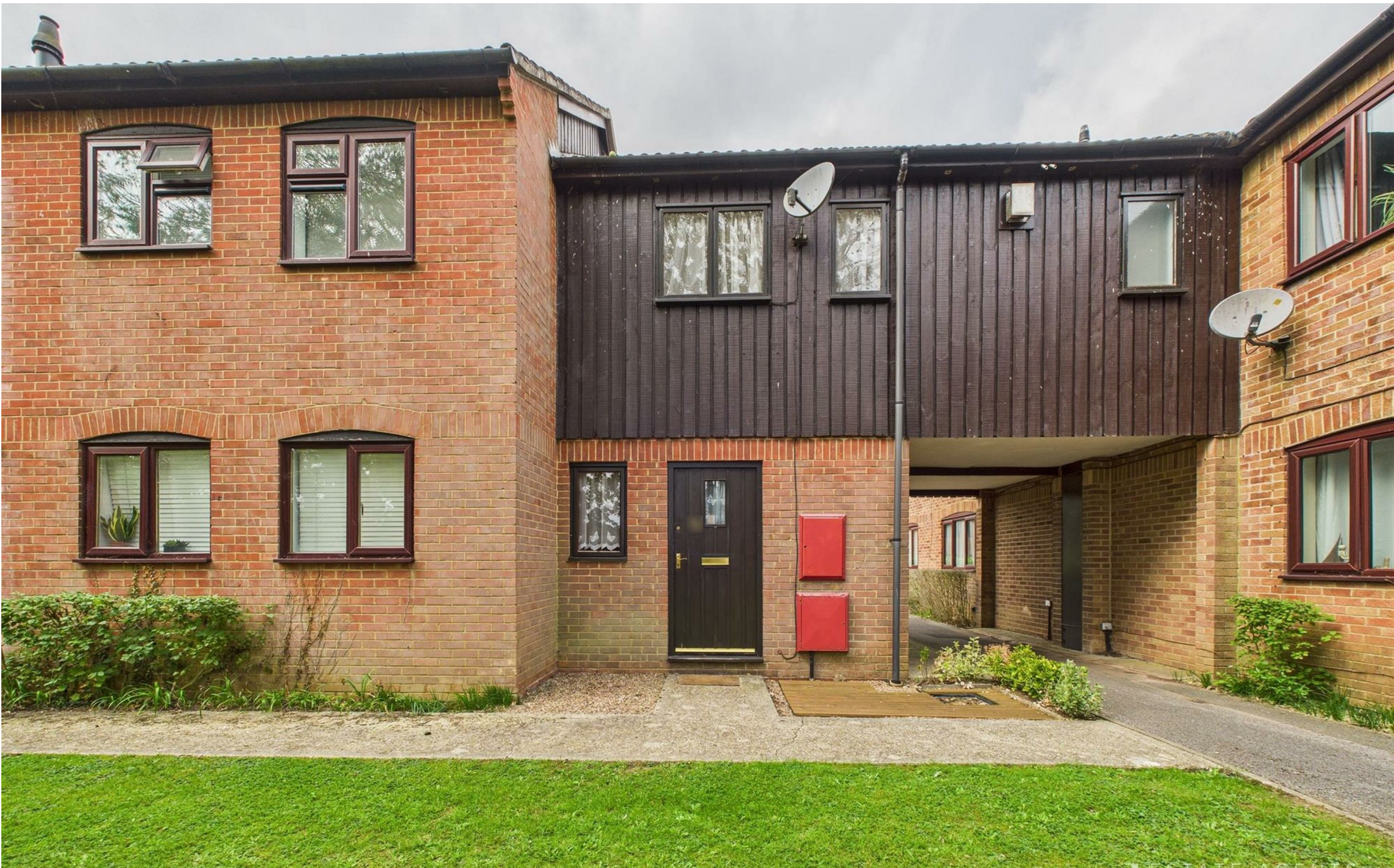
Alpine Court, Basingstoke, RG22 5EF