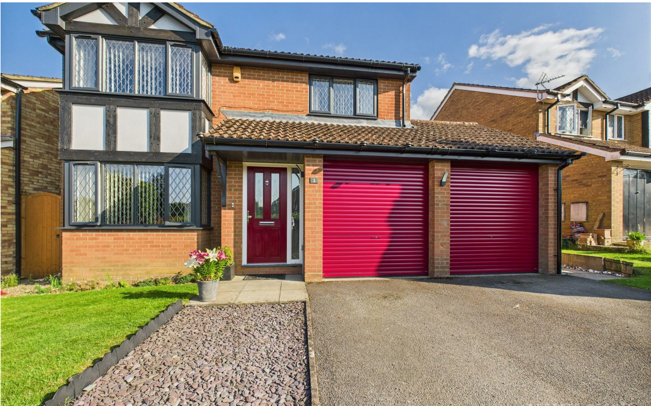
Sherwood Close, Basingstoke, RG22 4DD