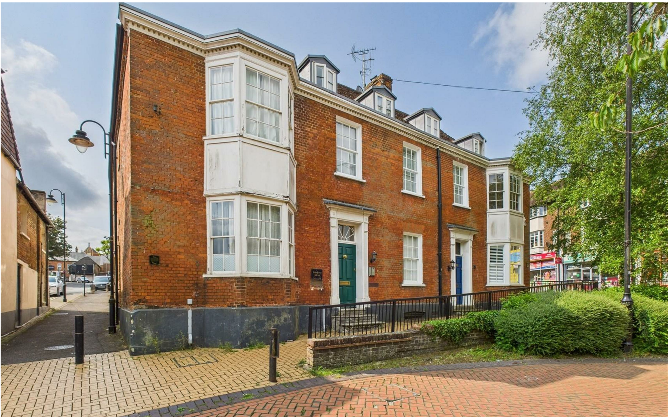
Windover Mews, Cross Street, Town Centre, Basingstoke, RG21 7BP