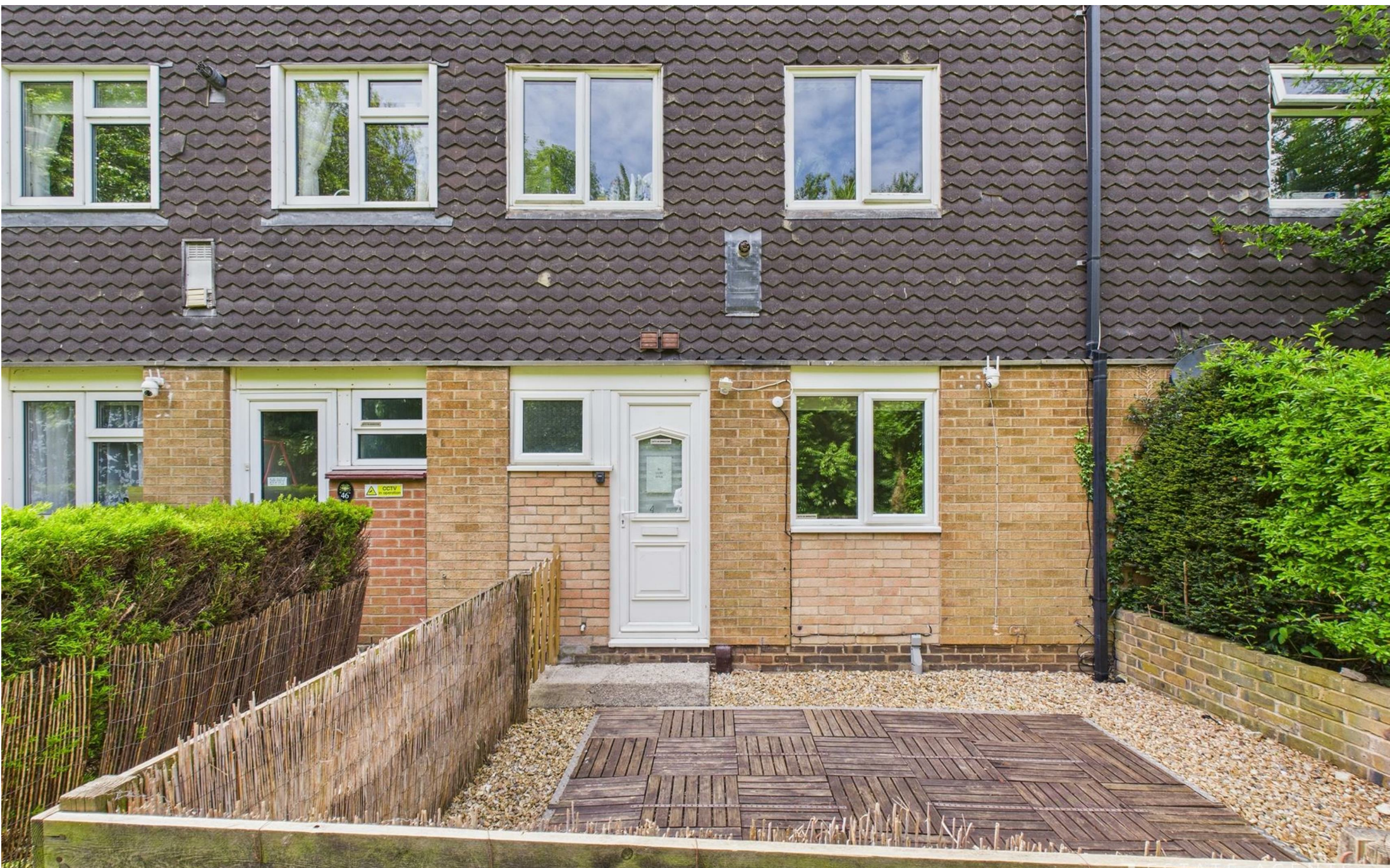
Selby Walk, Basingstoke, RG24 9EE