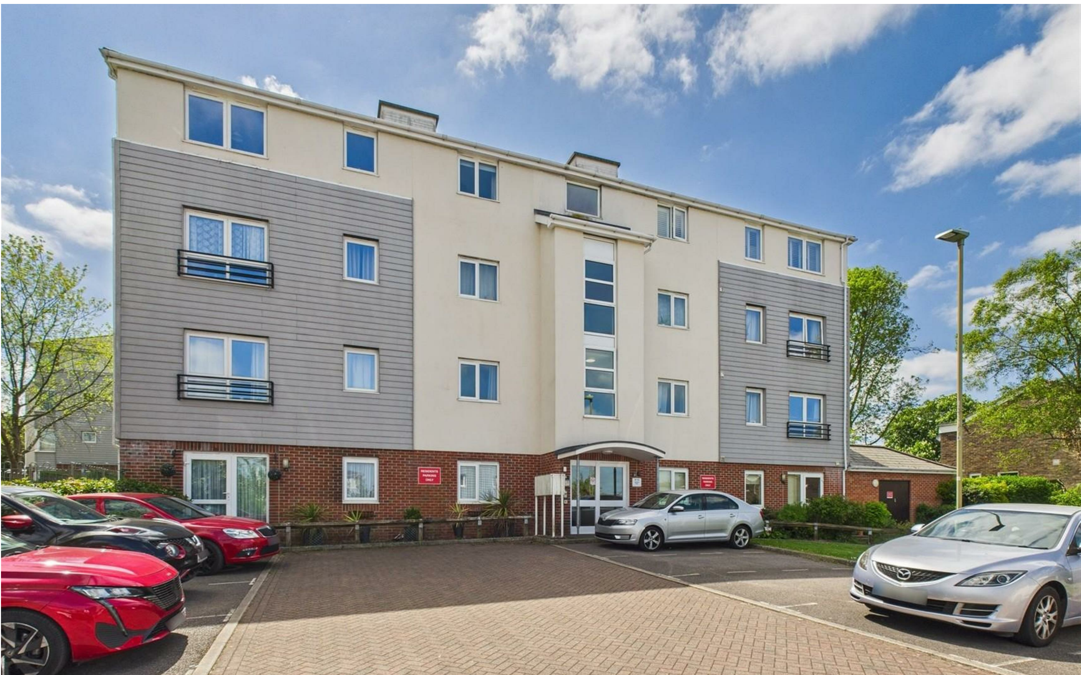
Rossetti Close, Popley, Basingstoke, RG24 9FF