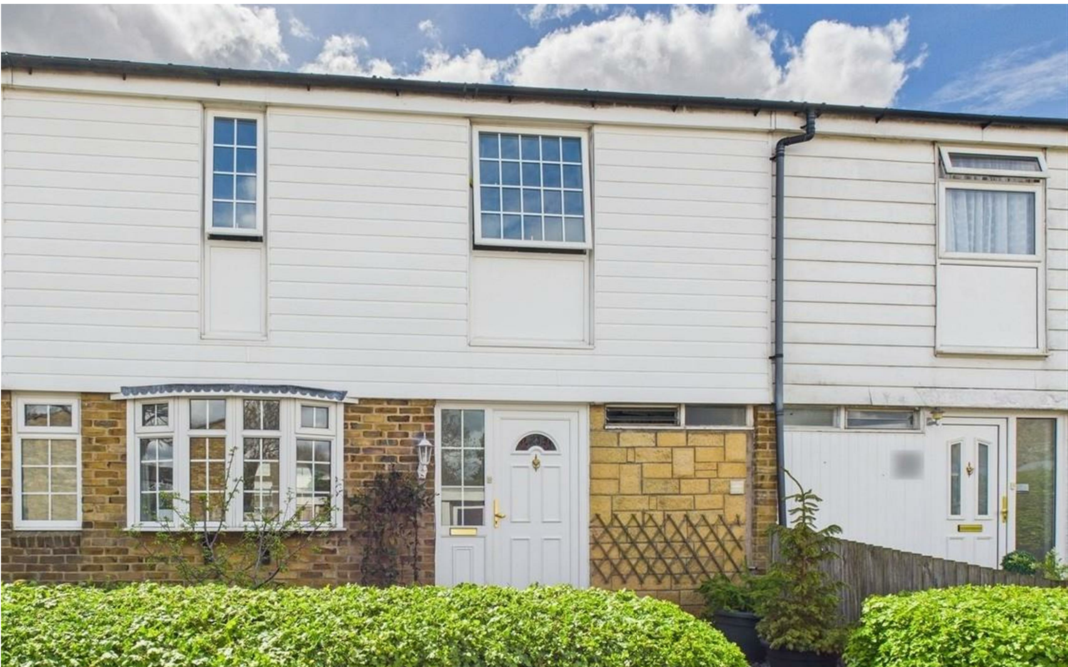
Mourne Close, Buckskin, Basingstoke, RG22 5BD