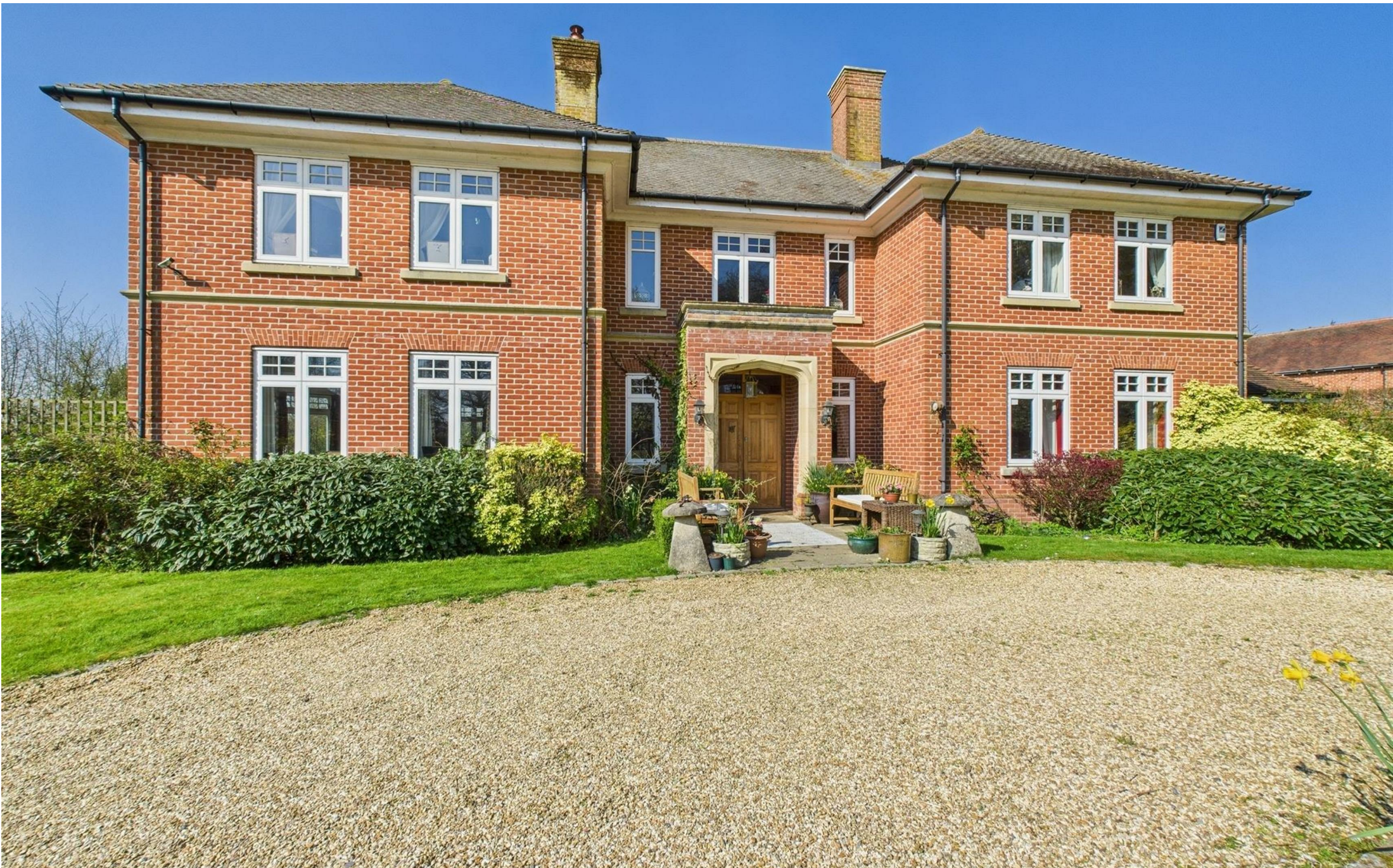
Herriard Green, Herriard, Basingstoke, RG25 2FD