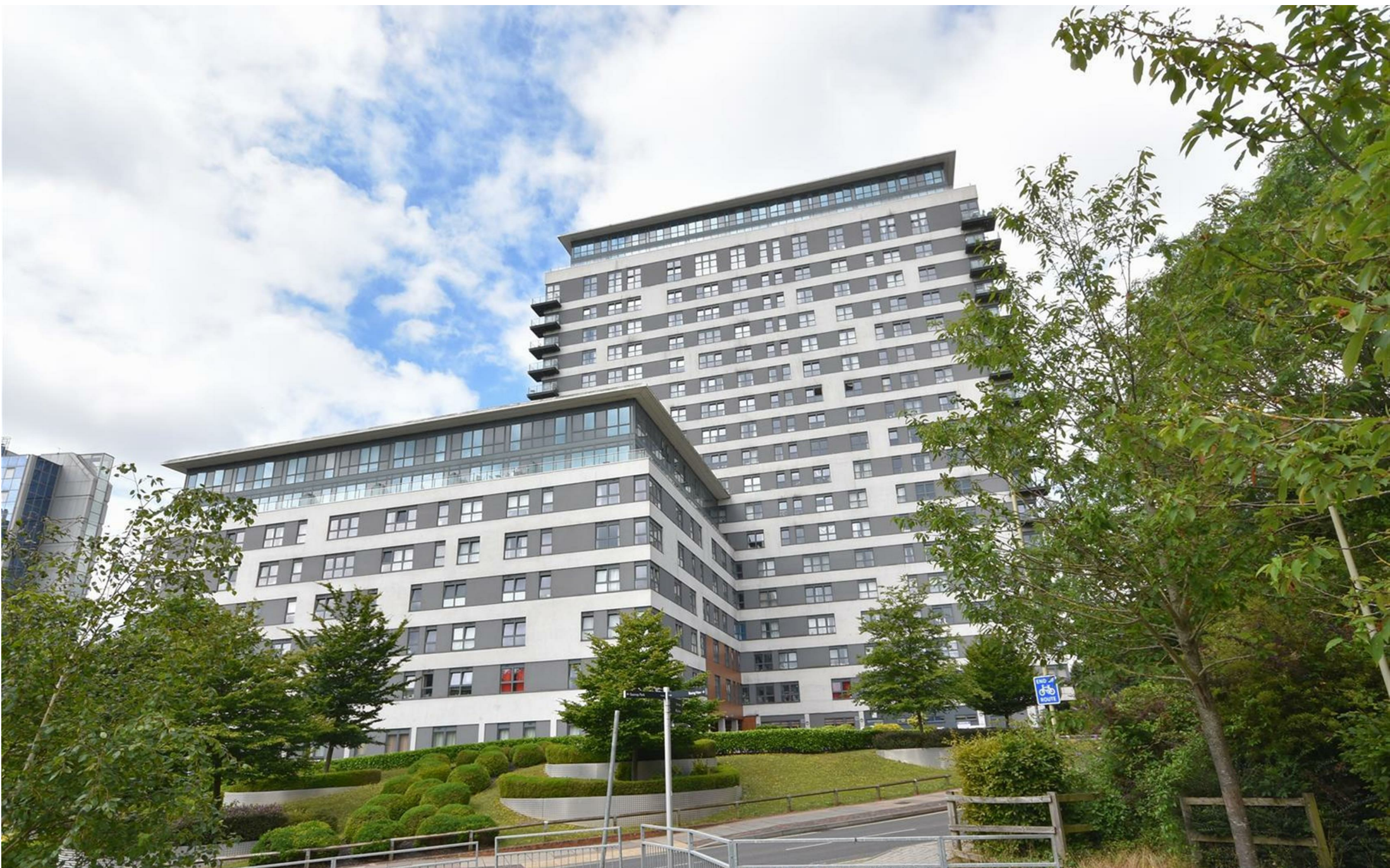
Skyline Plaza, Alencon Link, Basingstoke, RG21 7AX