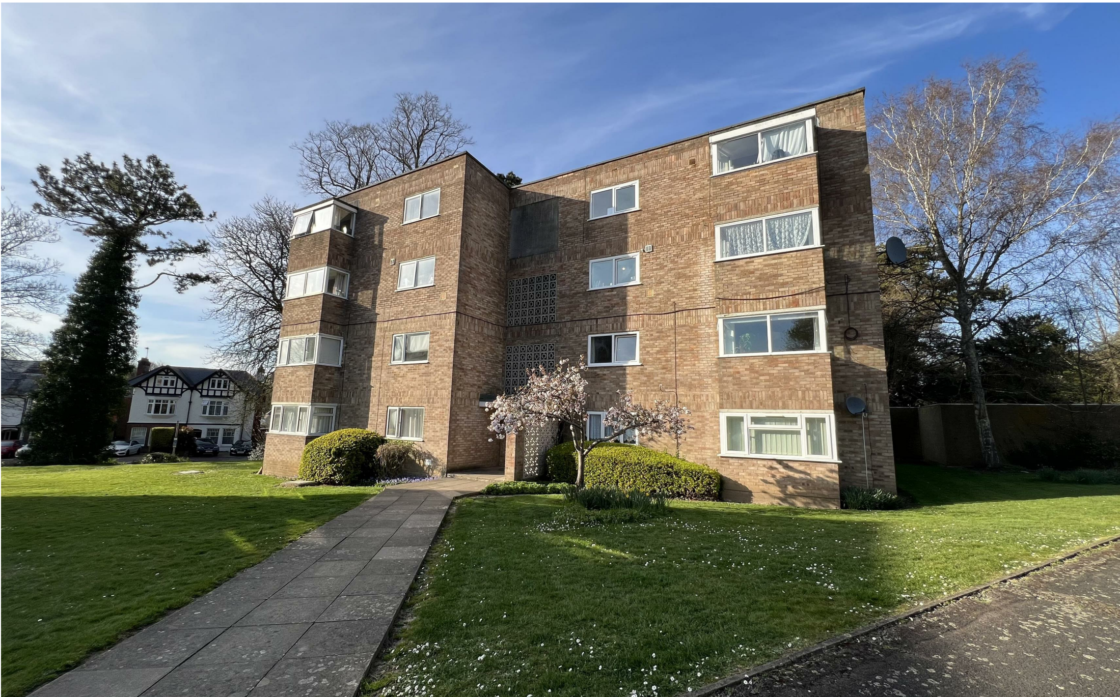
Ashley Lodge, Frescade Crescent, Basingstoke, RG21 3NE