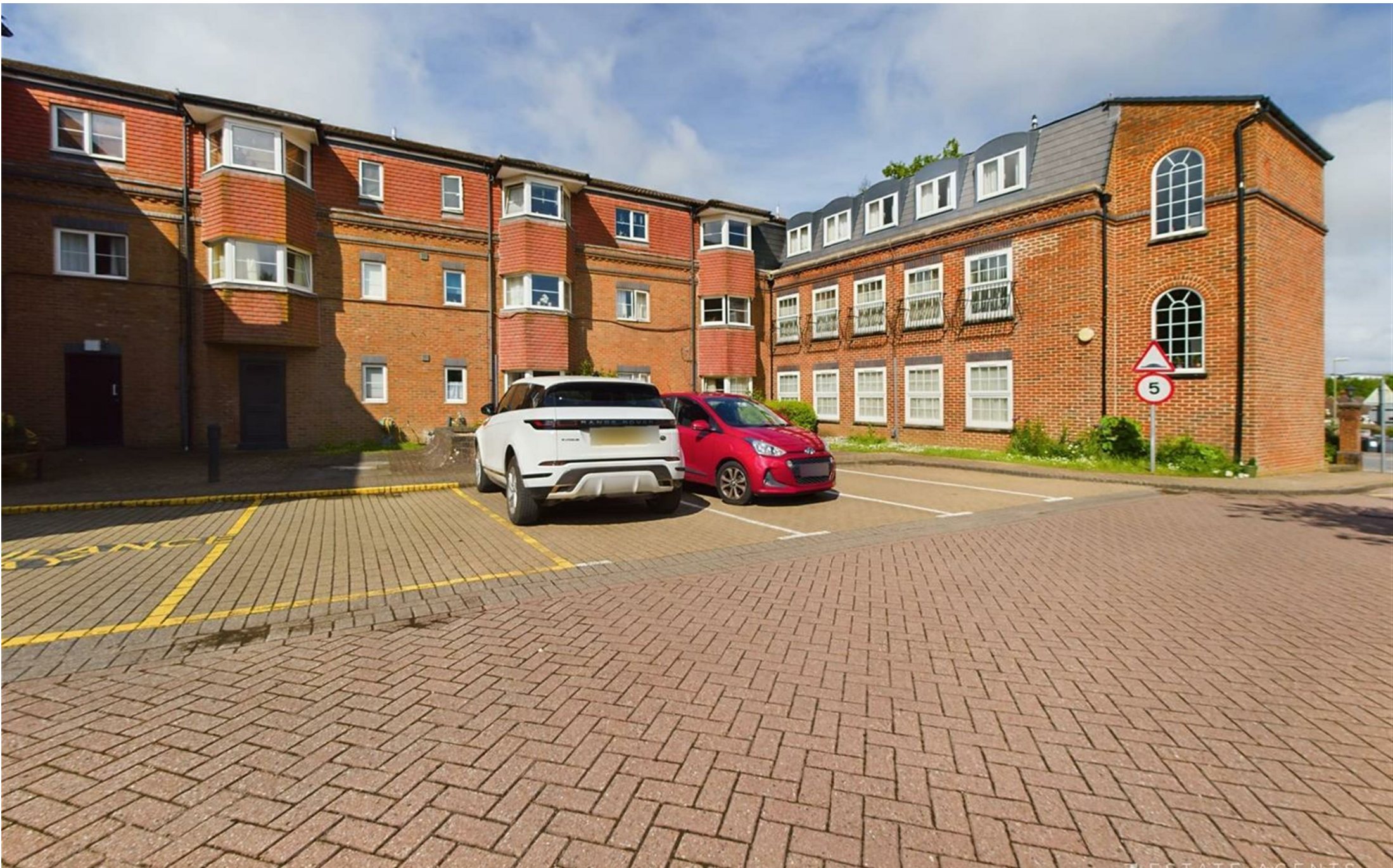
Westdeane Court, Basingstoke, RG21 8SX