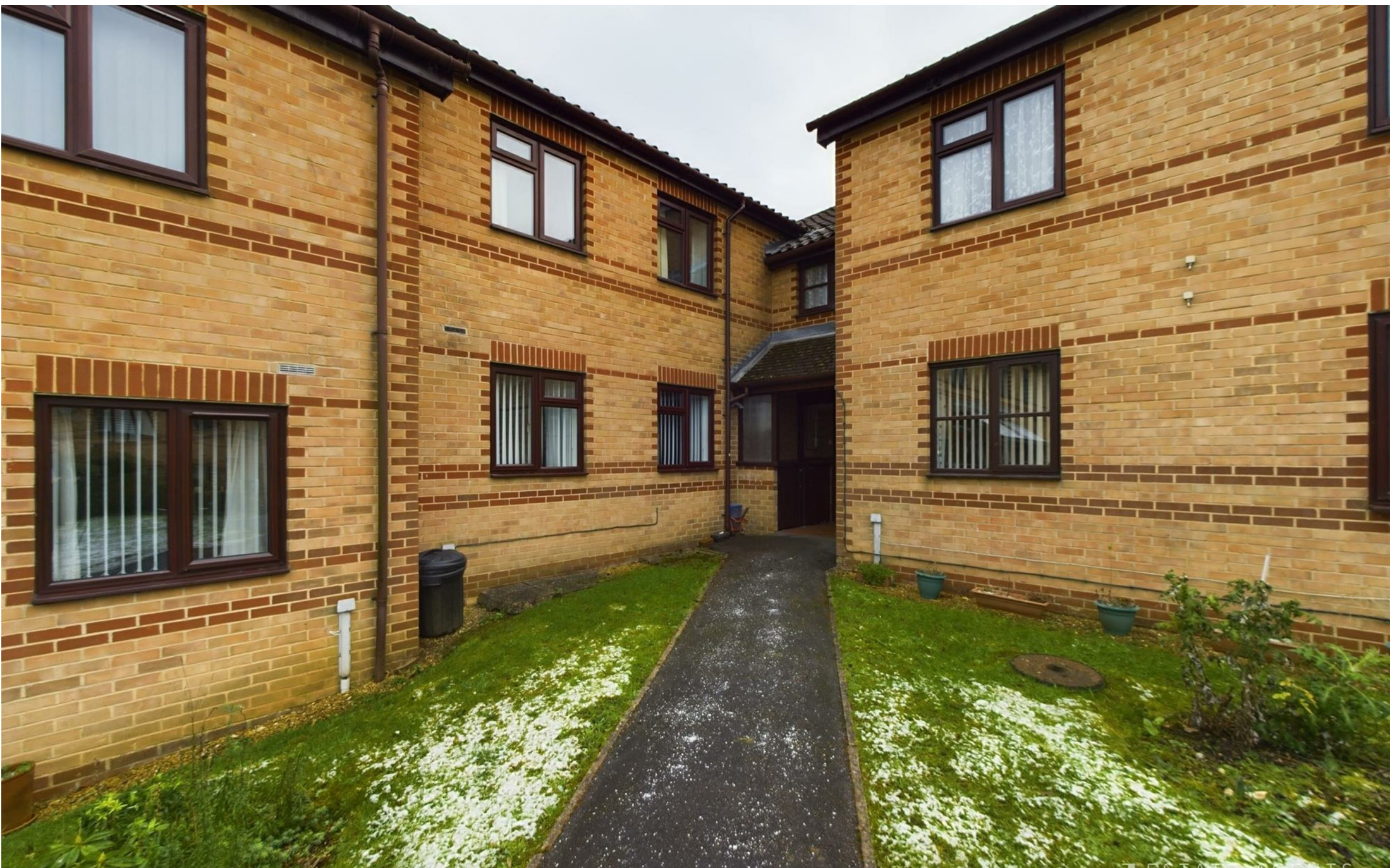
Gershwin Court, Basingstoke, RG22 4NN