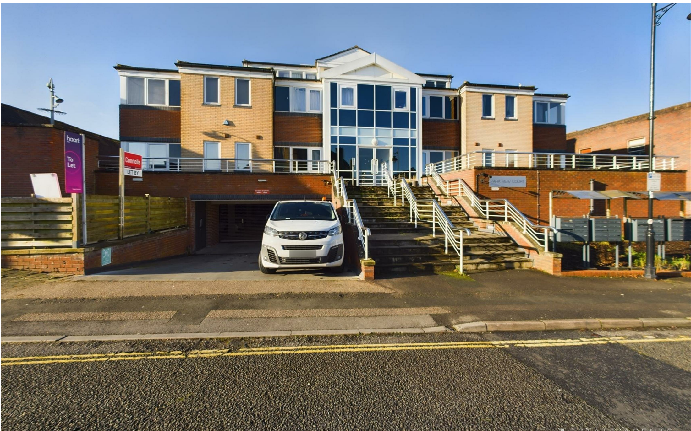
Park View Court, Victoria Street, Basingstoke, RG21 3FJ