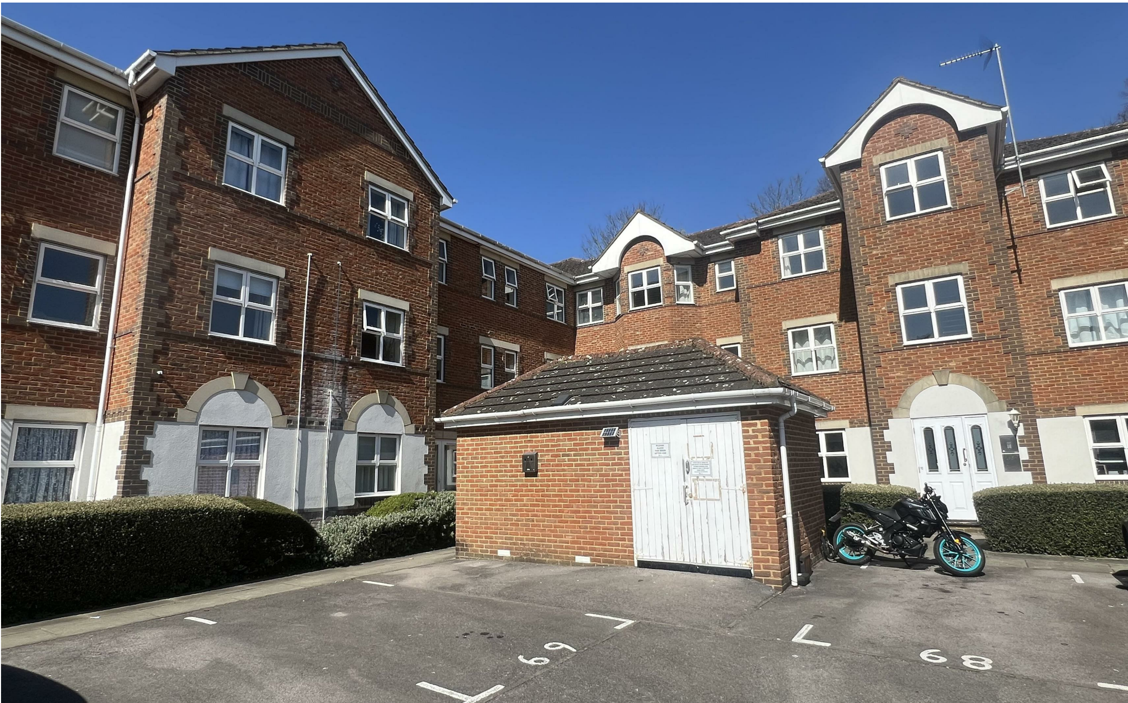
Regent Court, Norn Hill, Basingstoke, RG21 4HP