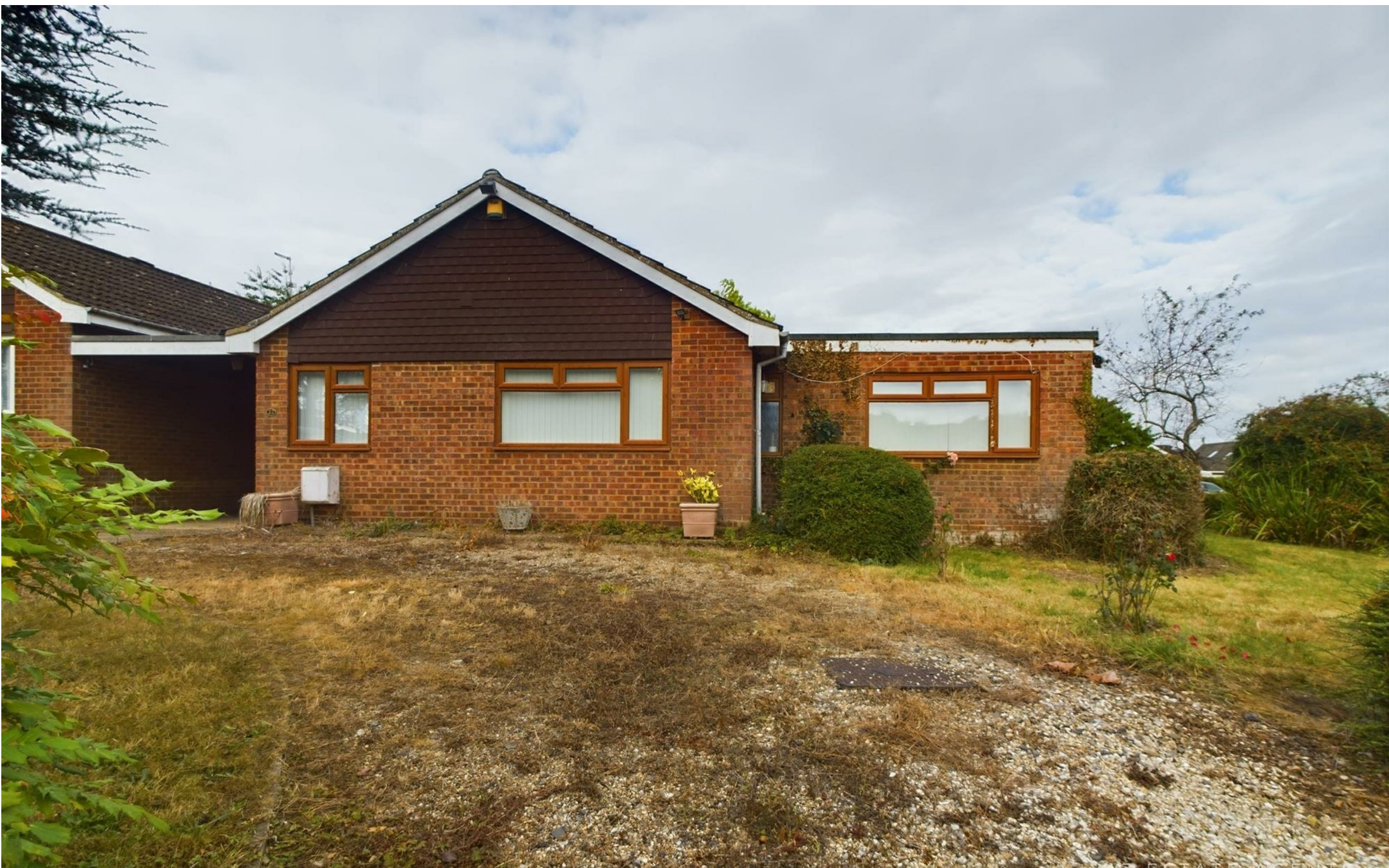
Vine Tree Close, Pound Green, Tadley, RG26 3SS