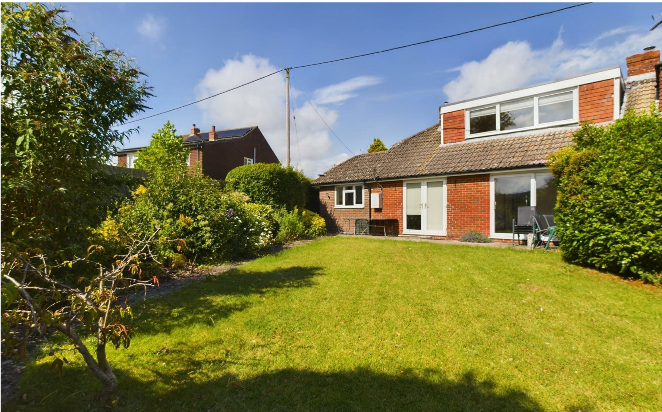
Hackwood Lane, Cliddesden, Basingstoke, RG25 2NH £600,000 Offers in excess of - Freehold