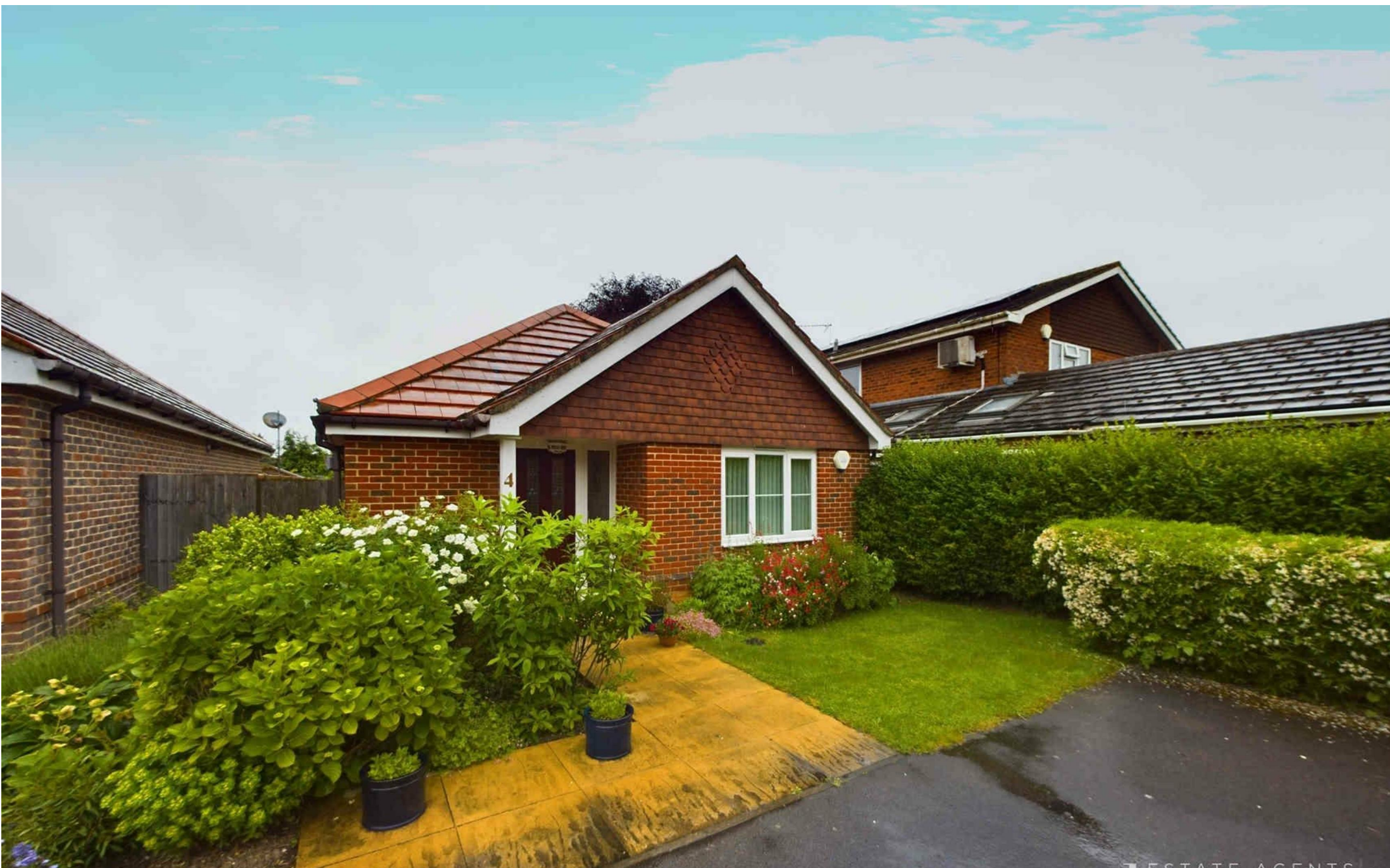
Percival Place, Old Basing, Basingstoke, RG24 7AD