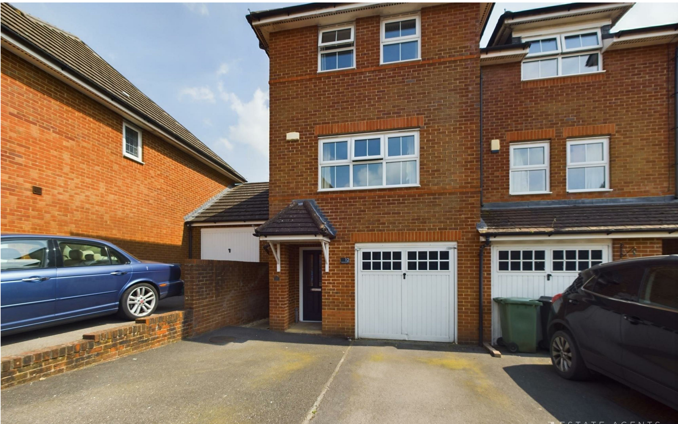
Rycroft Meadow, Beggarwood, Basingstoke, RG22 4QF