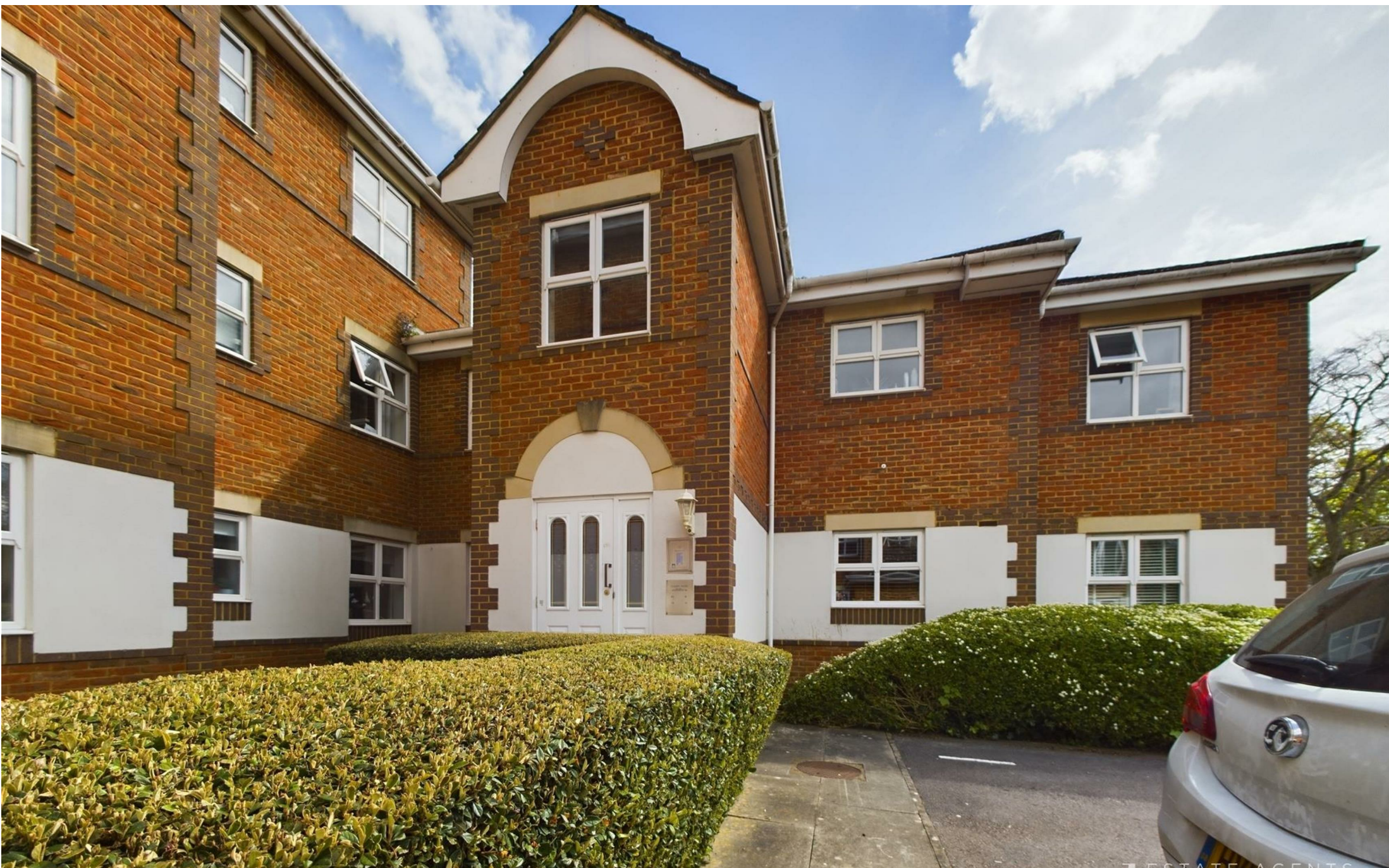
Regent Court, Norn Hill, Basingstoke, RG21 4HP