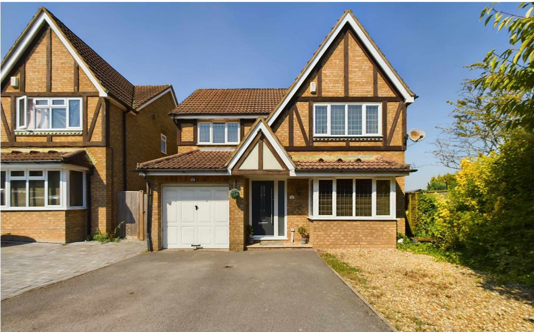
Belmont Heights, Hatch Warren, Basingstoke, RG22 4RW