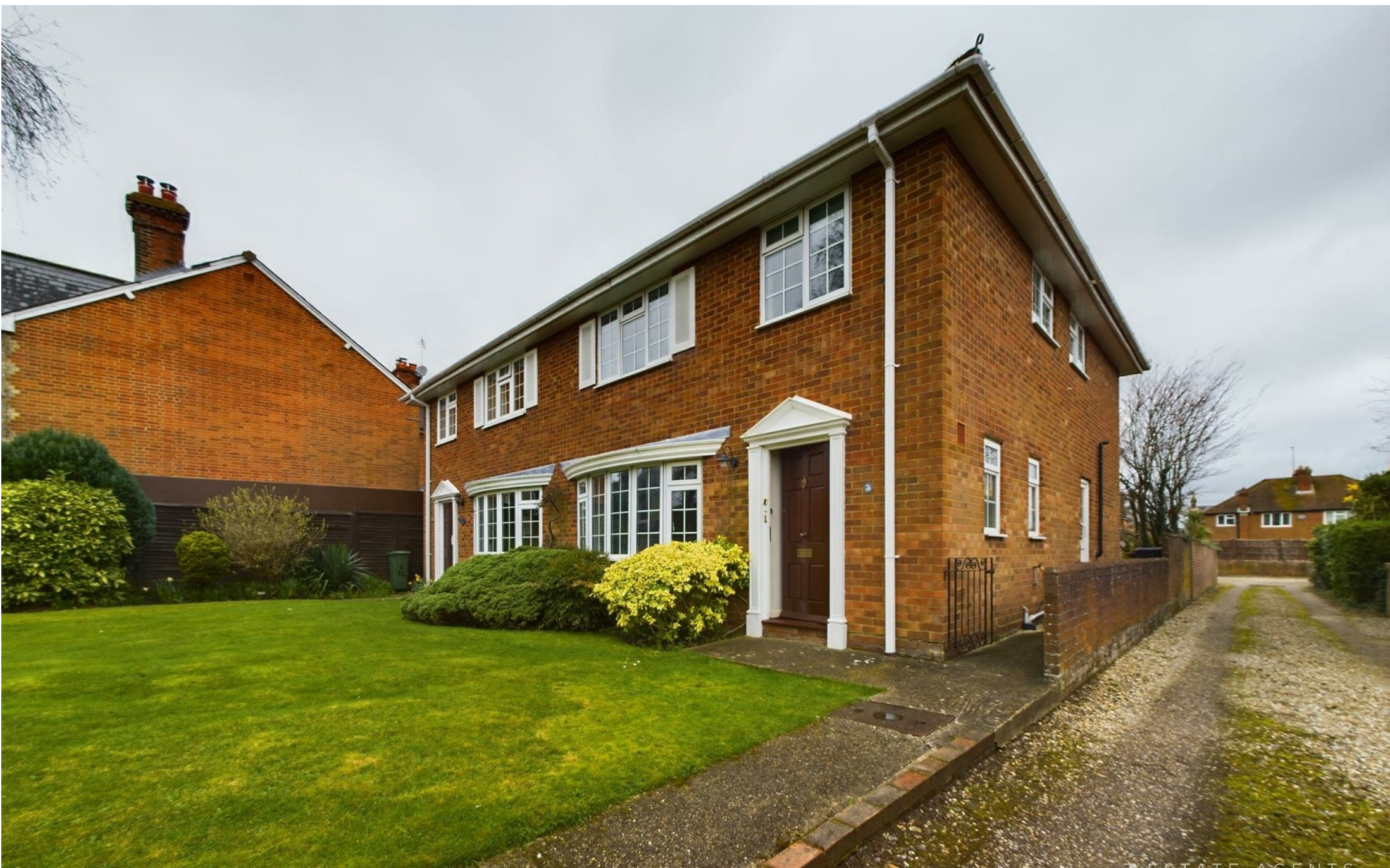
Fairfields Court, Fairfields Road, Basingstoke, RG21 3ED