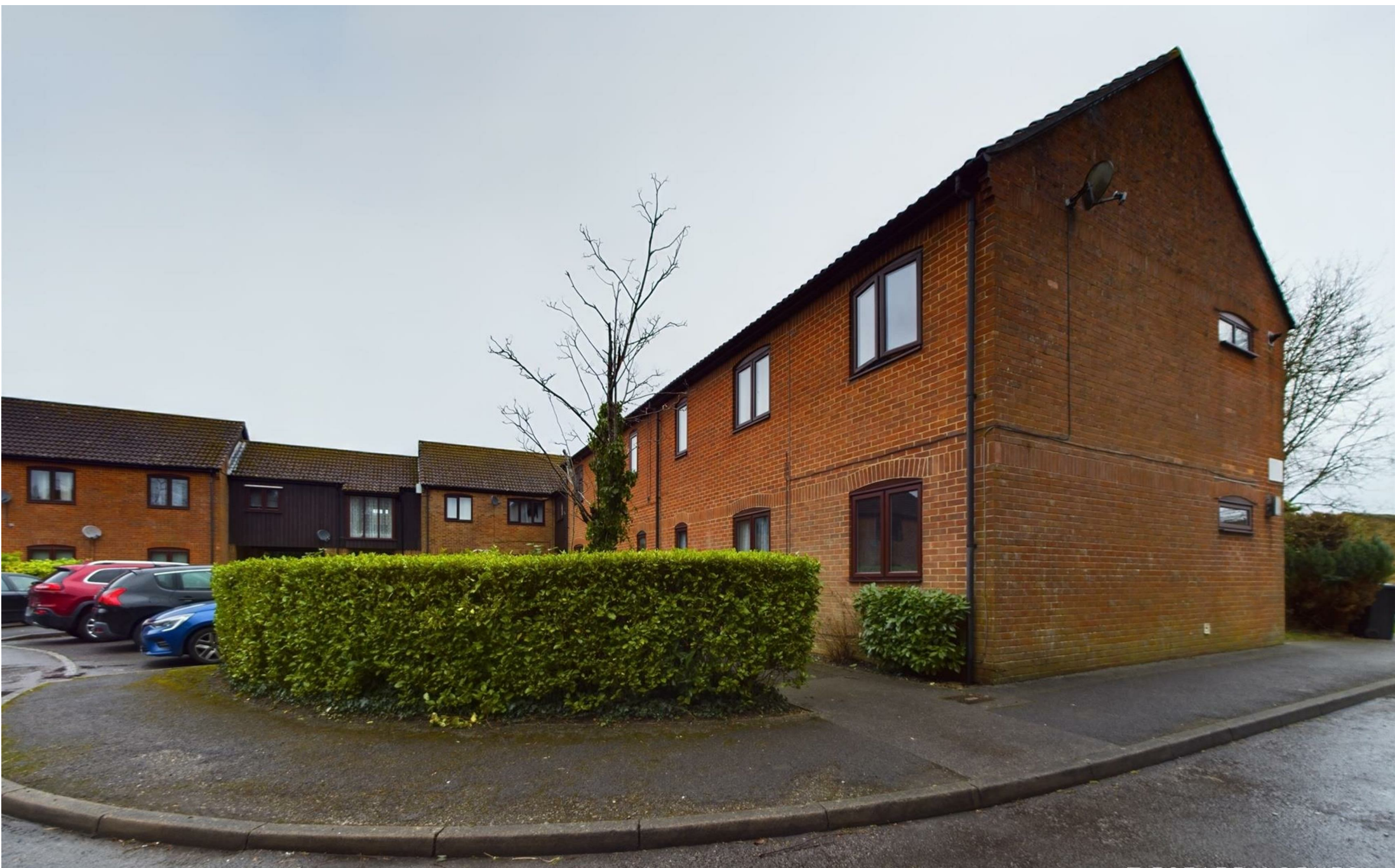
Alpine Court, Basingstoke, RG22 5EF