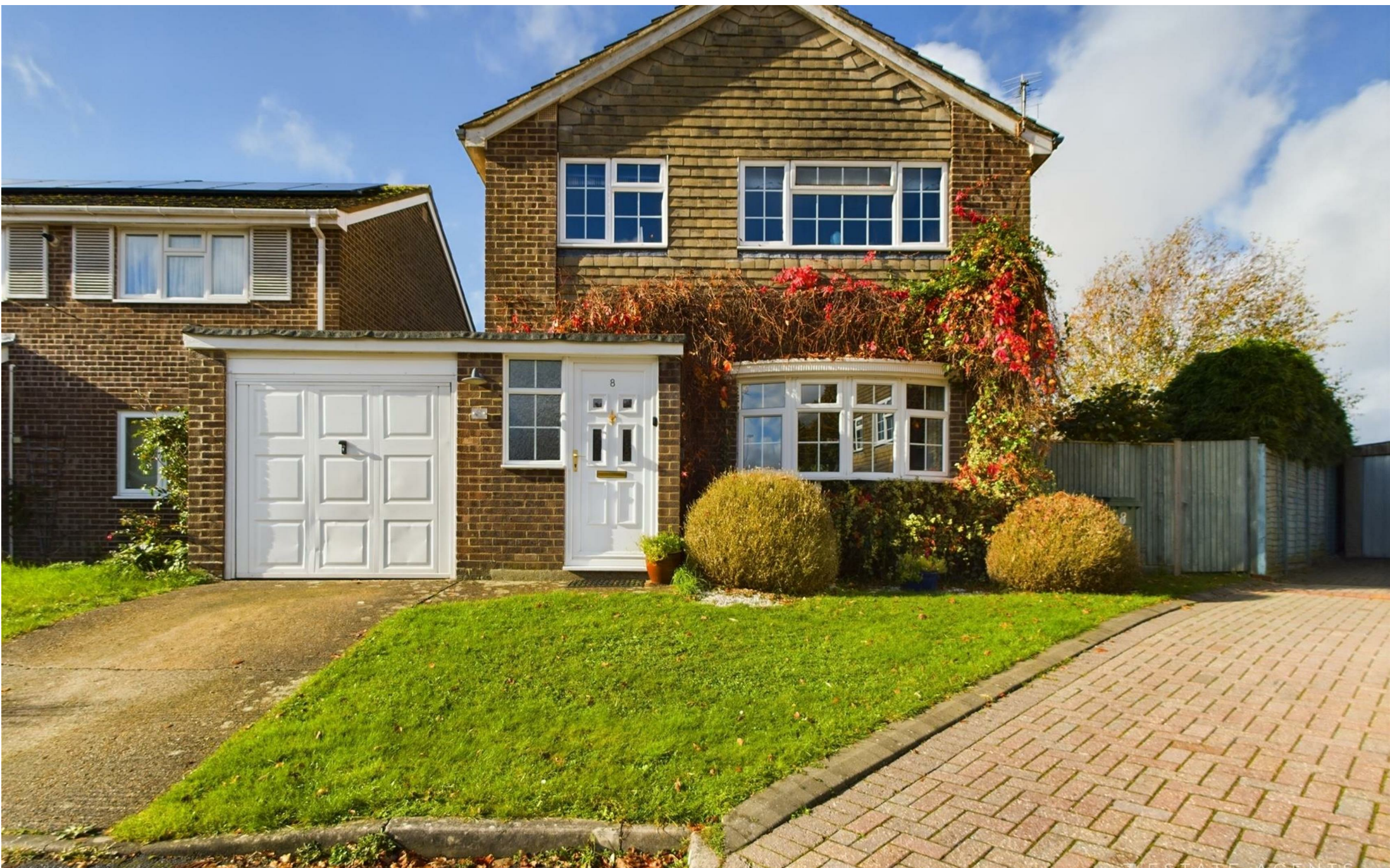
Pheasant Close, Kempshott, Basingstoke, RG22 5QQ