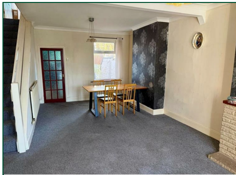
GROUND FLOOR 445 sq. ft. (41.3 sq. m.) approx.