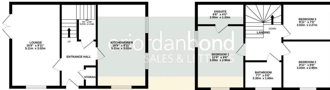
1ST FLOOR 462 sq.ft. (42.9 sq.m.) approx.

TOTAL FLOOR AREA: 915 sq.ft. (85.0 sq.m.) approx.