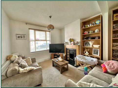
GROUND FLOOR 405 sq.ft. (37.6 sq.m.) approx.