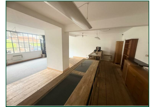
GROUND FLOOR 573 sq.ft. (53.2 sq.m.) approx.