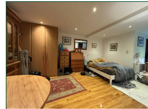
GROUND FLOOR 349 sq.ft. (32.4 sq.m.) approx.