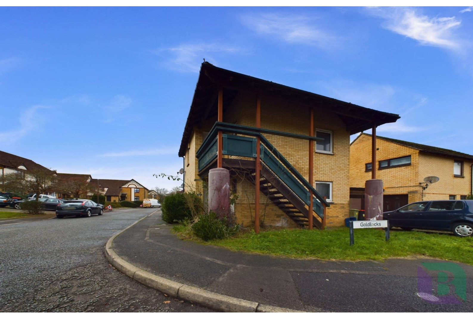
A first floor one bedroom maisonette offered for sale with no onward chain. While the property requires some sprucing up, it presents an excellent opportunity for an investment or a first-time buyer looking to make it their own.

Goldilocks, Walnut Tree, Milton Keynes, MK7 7LF Price £135,000 Leasehold