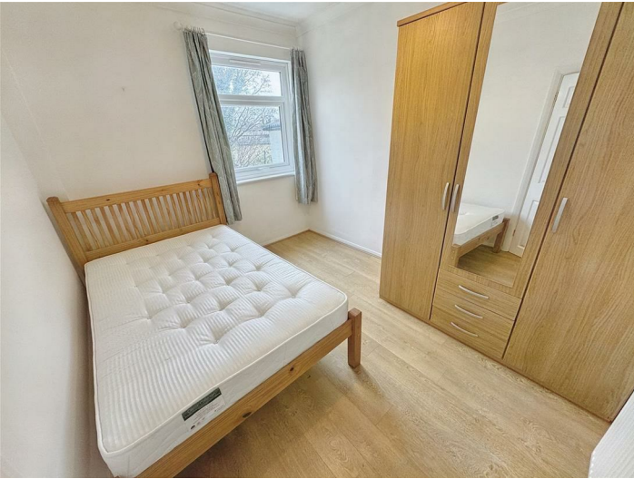
double glazed window to rear elevation - radiator - power points - wood effect floor covering.