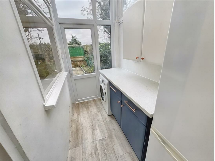
range of eye and base level units - space and plumbing for washing machine - space for fridge/freezer - power points - double glazed window - double glazed door to rear garden.