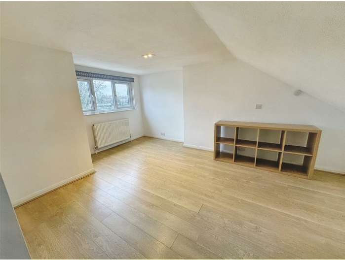
skylight to front elevation - double glazed window to rear elevation - radiator - power points - wood effect floor covering.