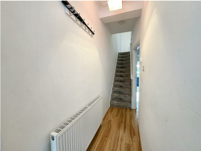
stairs ascending to first floor - radiator - wood effect floor covering - door to: Dining Room