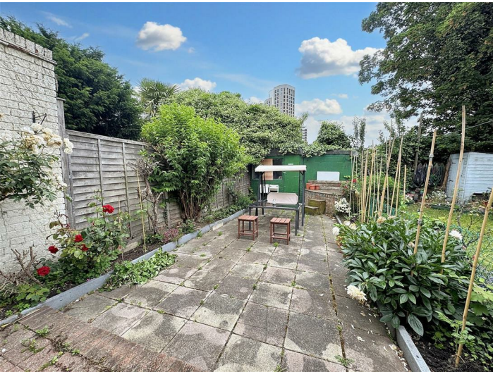
mainly paved with flower and shrub borders.

Council Tax London Borough of Newham Band C.