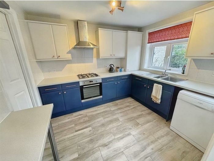
double glazed window to rear elevation - window to side elevation - cupboard housing Valliant boiler - range of eye and base level units incorporating a one and a half bowl sink with mixer taps and drainer - built in oven with four point gas hob and extractor fan over - space and plumbing for dishwasher - tiled splash backs - power points - radiator - wood effect floor covering - partially glazed door to: