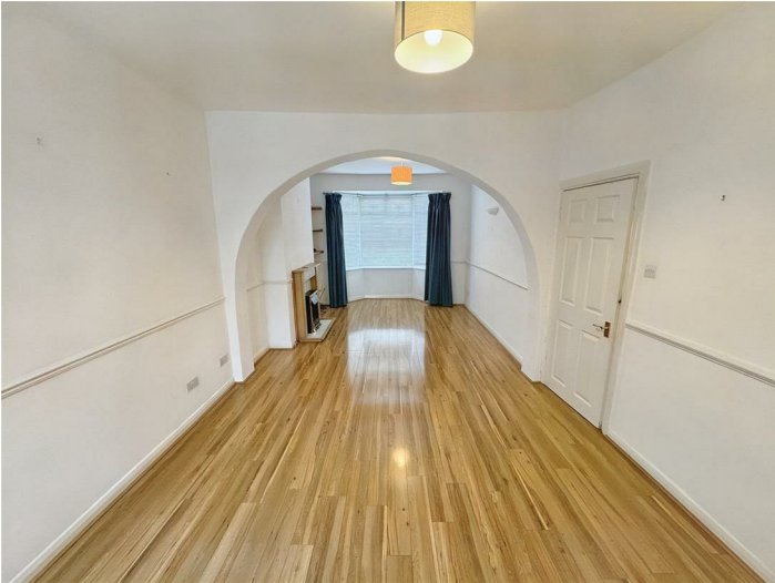
window to rear elevation - radiator - power points - door to kitchen - opening to: