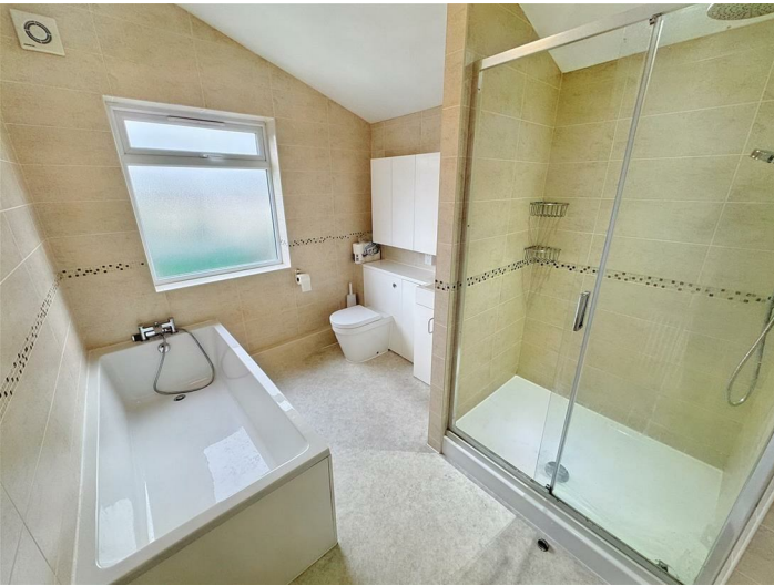
obscure double glazed window to rear elevation - wall mounted extractor fan - four piece suite comprising of a panel enclosed bath with mixer taps - shower cubicle - low flush w/c with concealed cistern - vanity sink unit - tiled walls - radiator - vinyl floor covering.