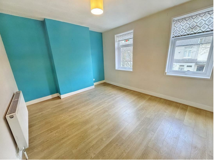
two double glazed windows to front elevation - radiator - power points - wood effect floor covering.