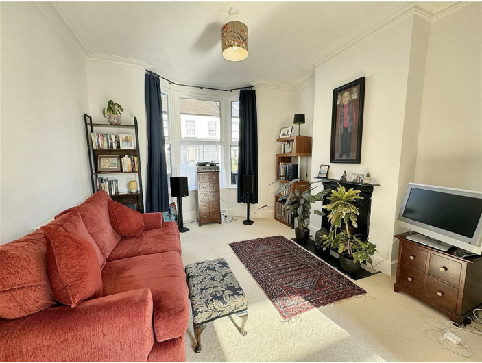
Reception Room 1

double glazed three splay bay window to front elevation - radiator - original type feature fireplace - power points - carpet to remain - double doors to: