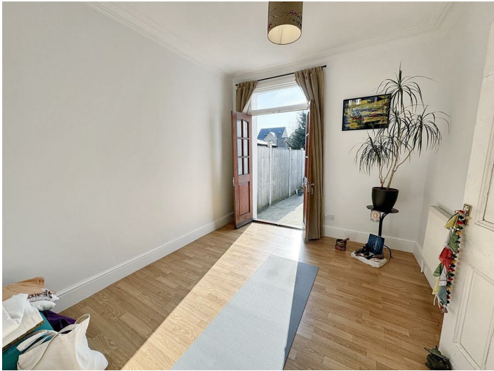
Reception Room 2

French doors to rear garden - radiator - power points - wood effect floor covering.