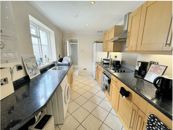
window to side elevation - wall mounted Vaillant boiler - range of eye and base level units incorporating a sink with mixer taps and drainer - built in oven with four point hob with extractor fan over - space and plumbing for washing machine - tiled splash backs - power points - tiled floor covering - door to: