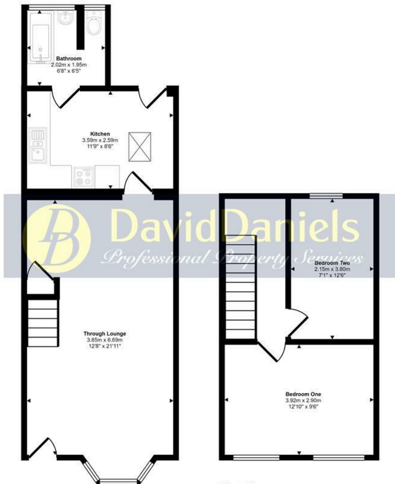
Ground Floor Approx 41 sq m / 437 sq ft