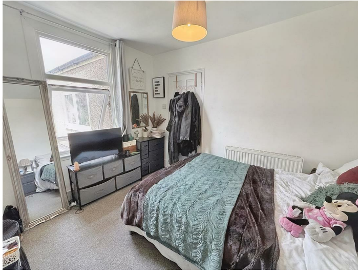
double glazed window to rear elevation - radiator - power points - carpet to remain.