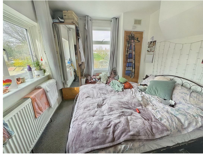
double glazed windows to side and rear elevations - radiator - power point - carpet to remain - cupboard housing Vaillant boiler.