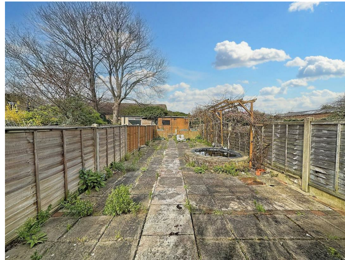
mainly paved with shed to rear.