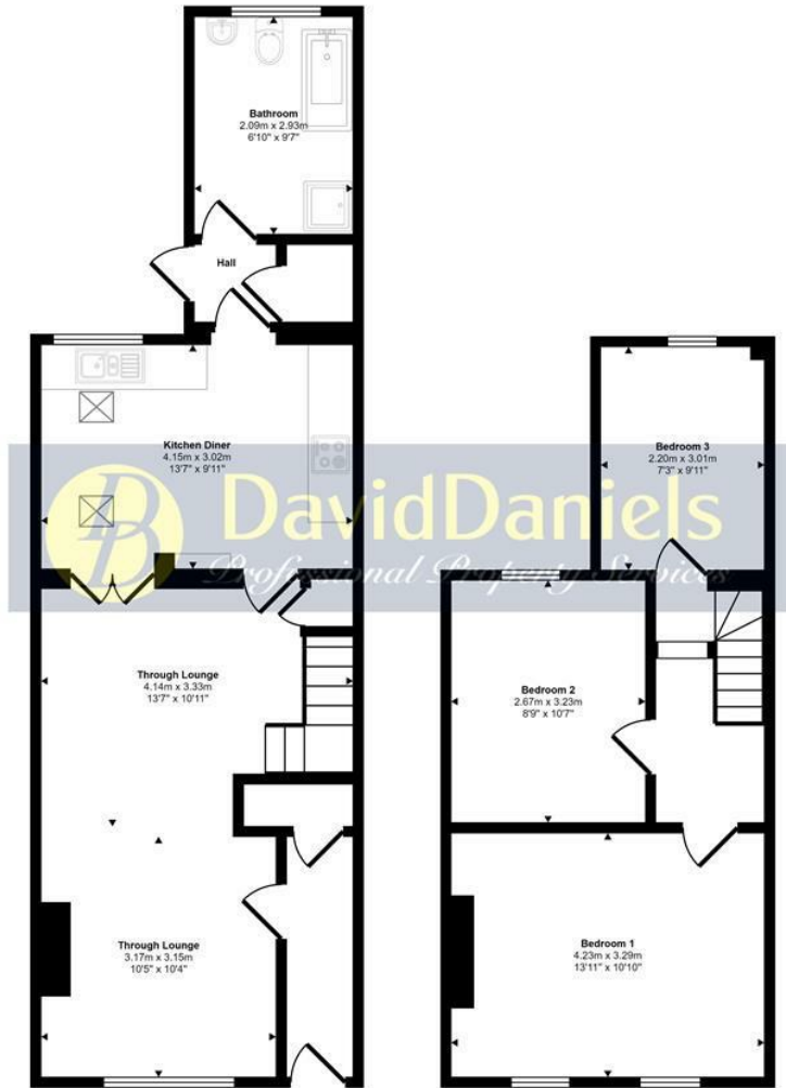
Ground Floor Approx 50 sq m / 542 sq ft