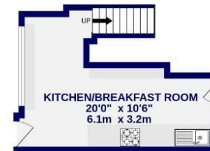
TOTAL FLOOR AREA : 939 sq.ft. (87.2 sq.m.) approx.

Whilst every attempt has been made to ensure the accuracy of the floorplan, measurements of rooms and any other items are approximate. If included in the plan the garage/porches will form part of the overall floor area and no responsibility is taken for any error, omission or mis-statement. This plan is for illustrative purposes only and should be used as such by any prospective purchaser. The services, systems and appliances shown have not been tested and no guarantee as to their operability. Made with Metropix ©2025