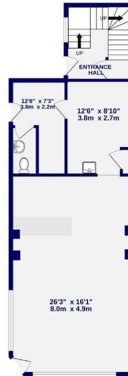
GROUND FLOOR 705 sq.ft. (65.5 sq.m.) approx.