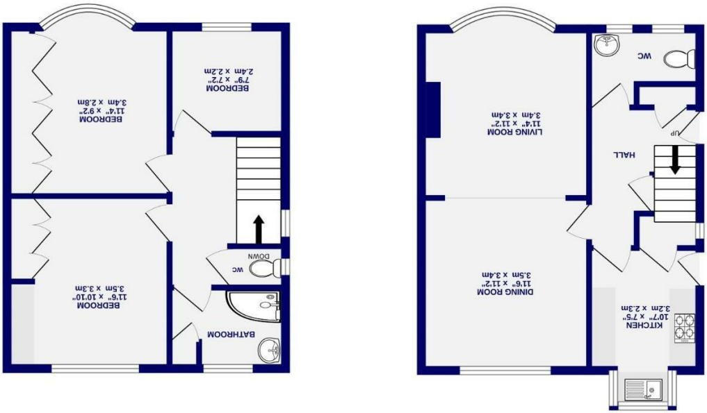
GROUND FLOOR 435 sq.ft. (40.4 sq.m.) approx.