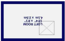
LOFT ROOM 108 sq. ft. (10.0 sq. m.) approx.

While every attempt has been made to ensure the accuracy of the floorplan contained here, measurements of doors, windows, rooms and other items are approximate and no responsibility is taken for any error, omission or mis-statement. This plan is for illustrative purposes only and should be used as such by any prospective purchaser. The services, systems and appliances shown have not been tested and no guarantee as to their operation or efficiency can be given. Made with Metropac C2023