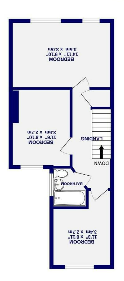
1ST FLOOR 443 sq.ft. (41.1 sq.m.) approx.