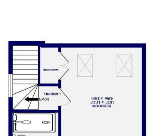
207 sq.ft. (28.6 sq.m.) approx.