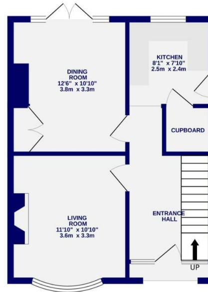
GROUND FLOOR 447 sq.ft. (41.5 sq.m.) approx.