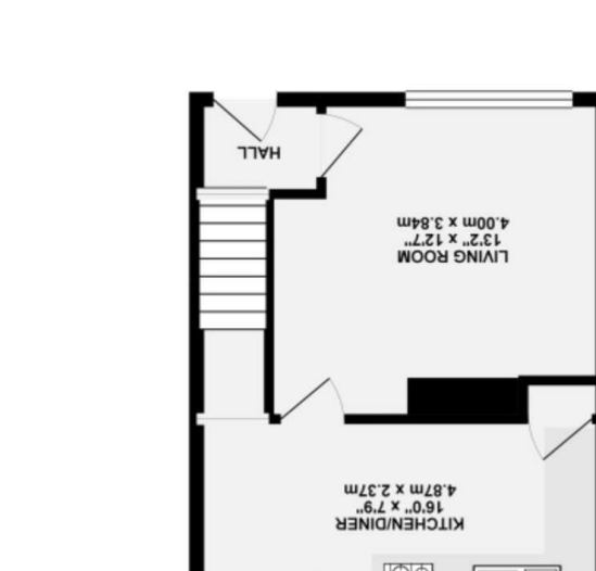
GROUND FLOOR 325.74 sq. ft. ( 30.26 sq. m. )