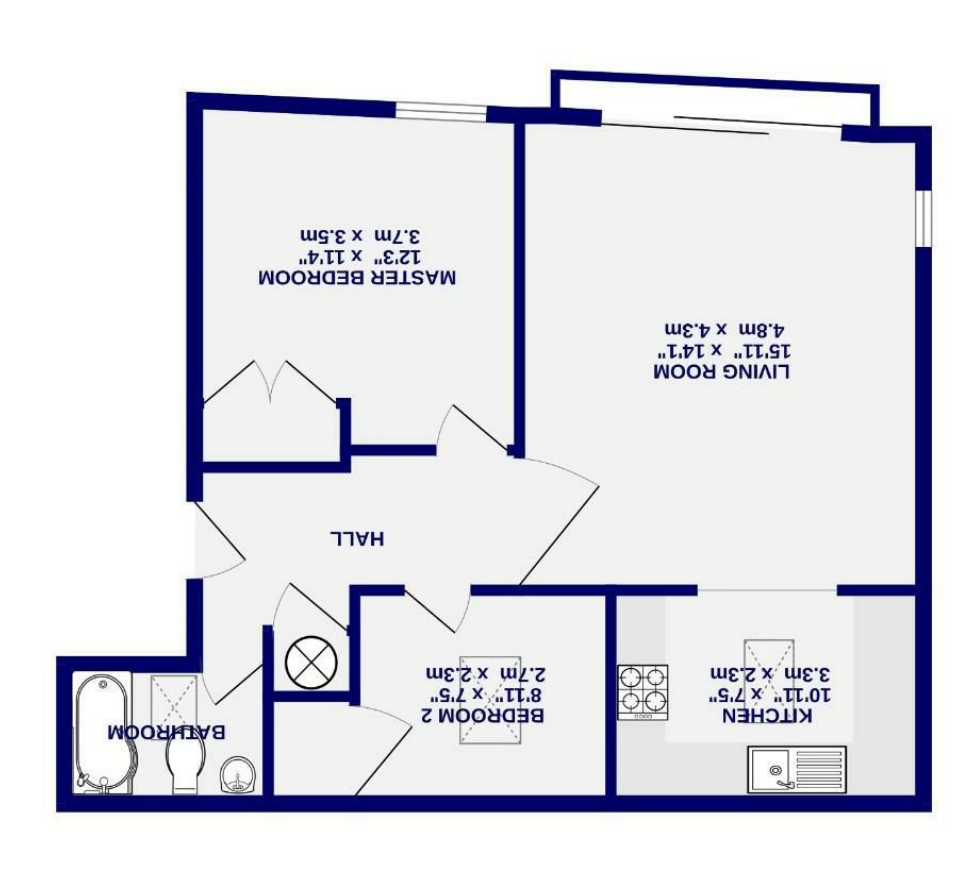
630 sq.ft. (58.5 sq.m.) approx. 1ST FLOOR